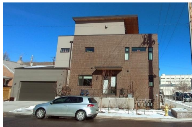
Step-backs applied to the front of a structure facing the street.