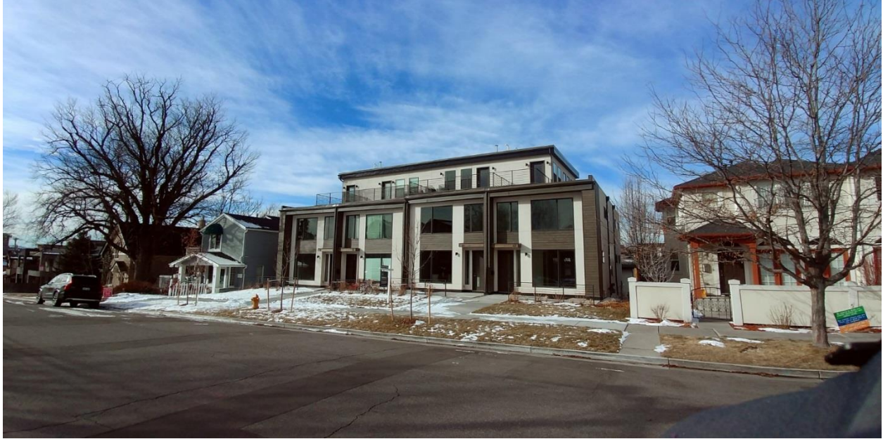
4-plex with step-back applied to the front of structure and also the side yards.