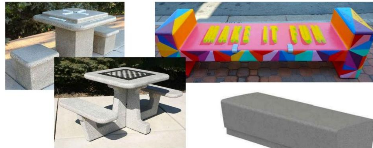
GAME TABLES / CONCRETE BENCHES