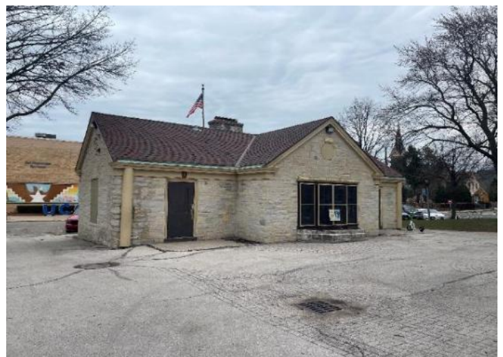
Figure 2: Pavilion within Walker Square Park.