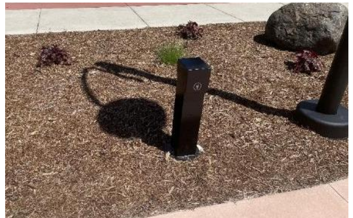
Figure 15: Pedestal power provides the ability to run lighting, food trucks, and supports other uses like markets. Ten Club Park, Waterford, Wisconsin.

Providing a reliable power supply in the park is crucial for supporting various activities, including markets and neighborhood gatherings. Access to electricity transforms the park into a versatile social space that can host events, offer charging stations for visitors, and support lighting and other electrical needs for planned activities. It also allows the park to operate autonomously, as WSNA desires. Access and restrictions on usage may be warranted.