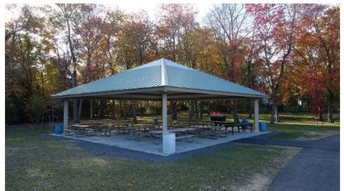
Figure 17: One option to bring a large open-air shelter was considered in Concept 2, but eliminated because it does not support the need for restrooms.