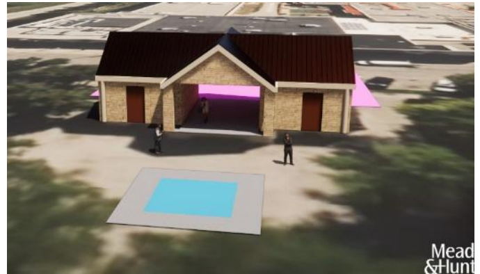
Figure 16: During design development, removal of the central core of the pavilion was explored as Concept 1 to create a pass through to 9 th Street. It was eliminated due to cost.

A new open-air shelter enhances the northern end of the plaza, expanding the picnic area and inviting those living north of the park into the space. The northern location was chosen for its proximity to both the playground and central plaza. Similar comfort station-covered picnic areas have proven successful at other parks, including Kern, McGovern, and Doctor's Parks. The existing restroom structure and wading pool