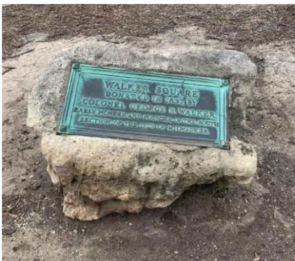
Figure 1: Walker Square Park Historical Plaque.