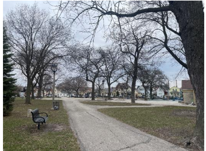
Figure 4: Walker Square Park

The Action Plan describes the park as a central and defining public square for the neighborhood. It provides a crucial open space for play, relaxation, reflection, and community events, enhancing the urban environment for nearby residents and schools.