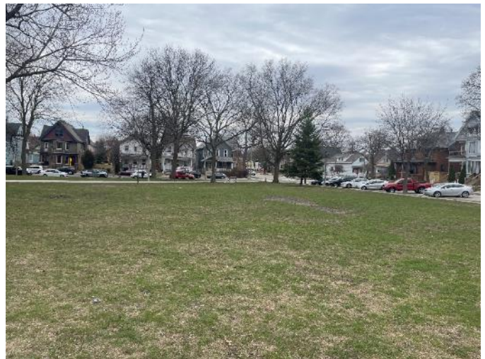
Figure 10: Large open grass play space. April 2025