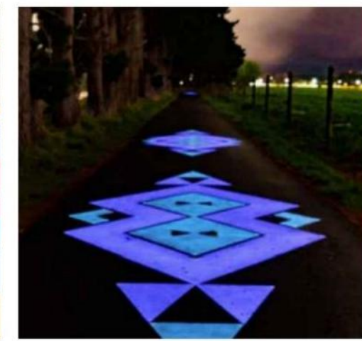
AMBIENT GLOW (STONE) TECHNOLOGY (ADDITIVE)