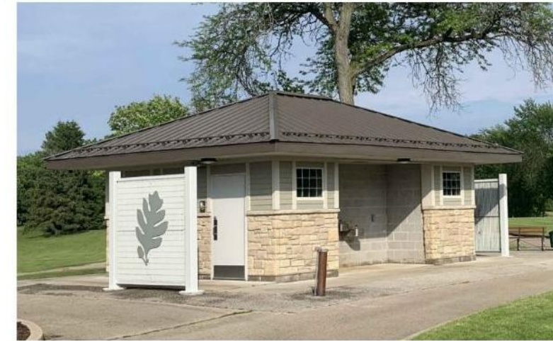
SHELTER MATERIAL DETAIL