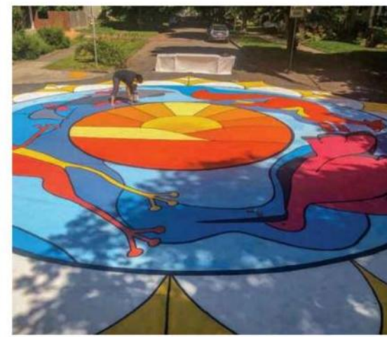
MINI MURAL OR PLAZA MURAL