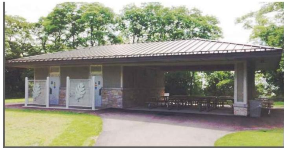
RESTROOM SHELTER (~60' x 32')