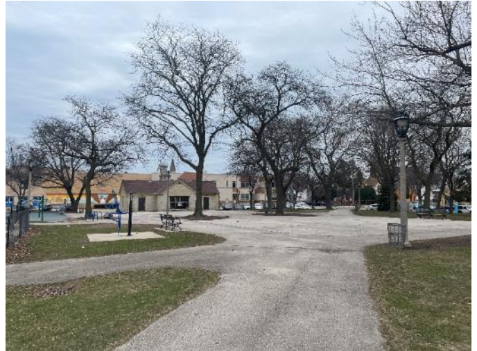
Figure 5: The central plaza in Walker Square Park stamped pavement in a decorative pattern, but little other permanent programming.

The plan also suggests adding a Bublr bike station, which was completed in 2016.