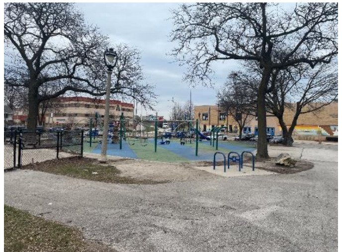
Figure 6: Walker Square Park Playground. April 2025.