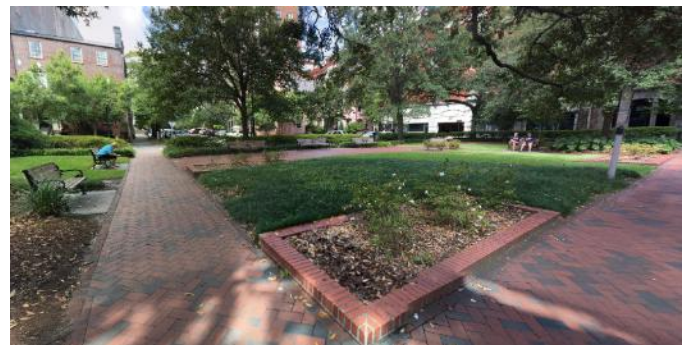
Figure 13: Seating within proximity of other seating attracts sitters. Reynolds Square, Savannah, Georgia.

The central plaza will benefit from increased seating. The proposed seating arrangements should encourage social interaction by grouping benches together rather than spreading them along the walkways. This design fosters social capital through proximity, making the park a more community-oriented space. A ratio of one linear foot of seating for every 30 square feet of the plaza is recommended to balance comfort and space.