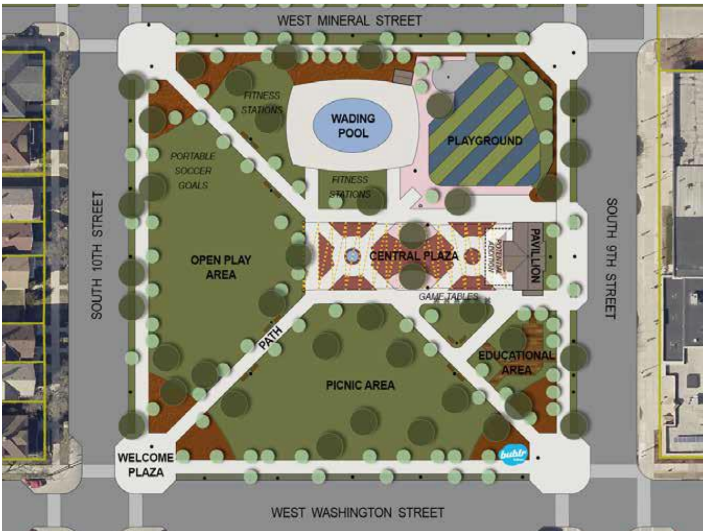
Figure 12: Conceptual Site Plan, Walker Square Strategic Action Plan, 2015