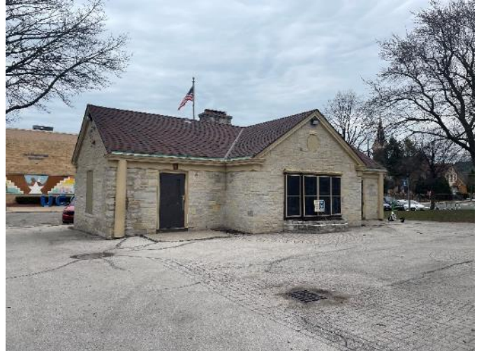
Figure 9: Walker Square Park Pavilion. April 2025