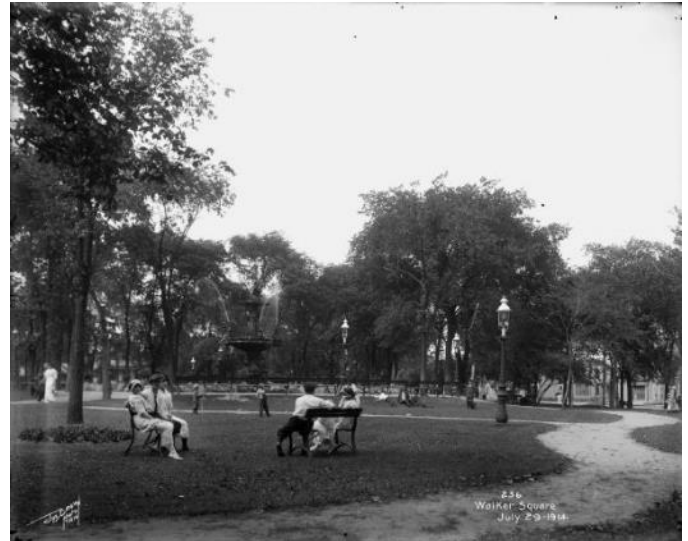
Figure 3: Walker Square Park, 1914. Note the monumental fountain, acting as a major attraction.

The Milwaukee County Parks Long-Range Park and Open Space Plan is the overarching vision for the County Parks System. This plan discusses the past, present and future of the system, with a planning horizon of 2050 and serves as a guide for park and open space planning for the region. While the plan does not give specific details for individual parks, the priorities of the plan and the goals outlined can be applied to Walker Square Park. For an in-depth analysis of how Walker Square Park meets the amenities and conditions of a neighborhood park as defined in the Parks and Open Space Plan, see the Typology section on page 3.