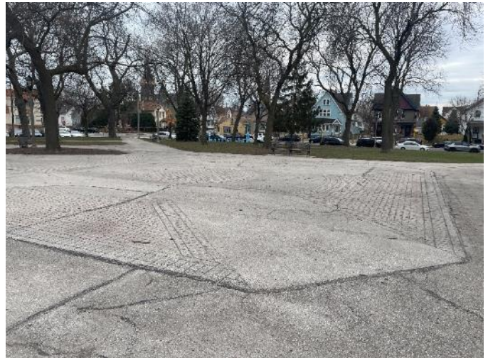
Figure 8: Walker Square Park Plaza. April 2025.