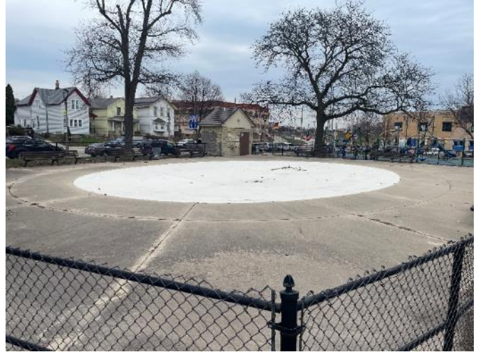
Figure 7: Walker Square Park Wading Pool. April 2025.