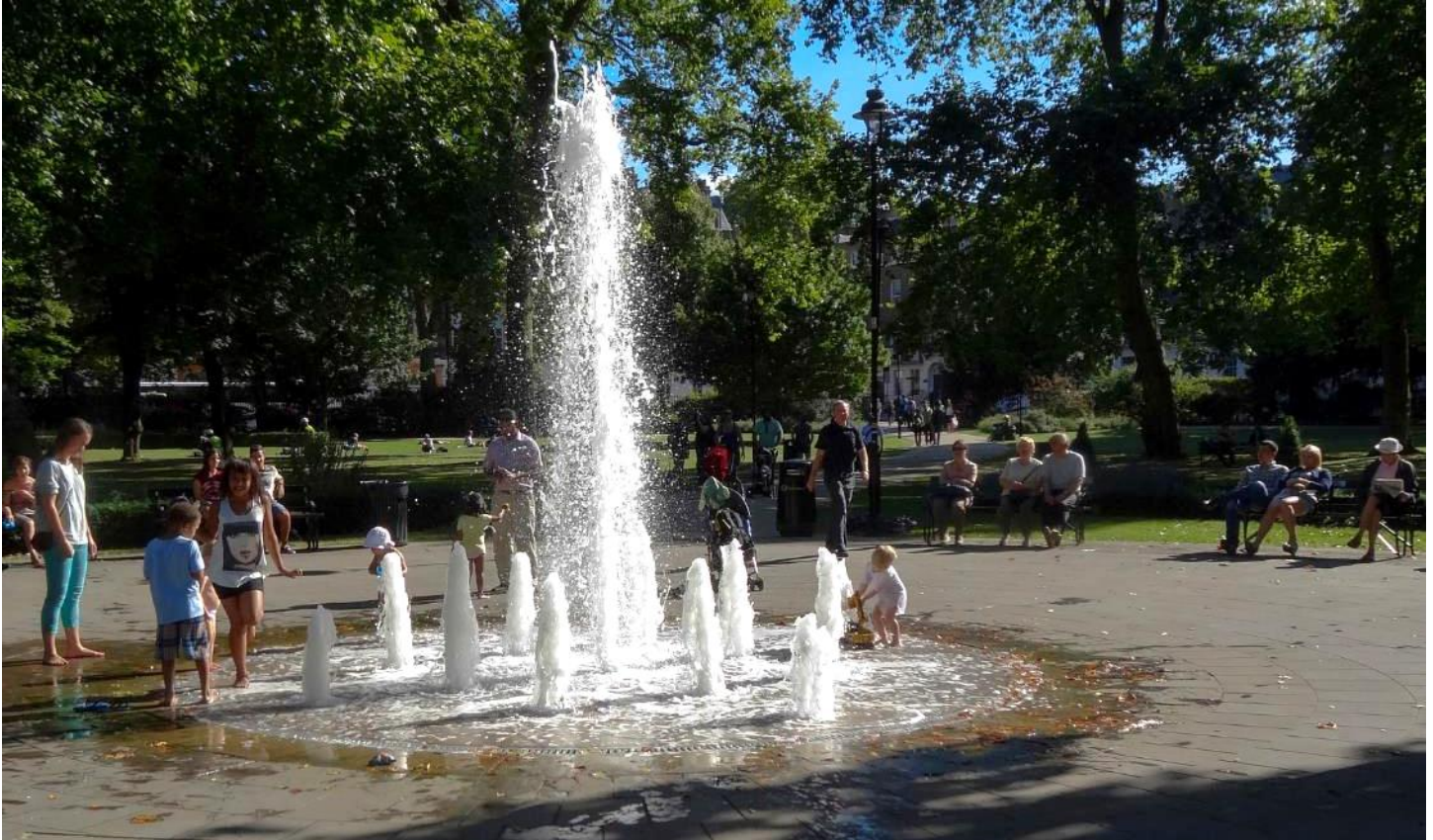
Figure 14: Play Fountains can draw a crowd of all ages and can be more formal in appearance while less formal in use than a traditional wading pool. They also don't require fencing.

Transforming the existing wading pool into a new water feature, such as a play fountain, will greatly enhance the park's appeal and usability. A play fountain offers an interactive and fun water play area that can be enjoyed by children and adults alike. This feature will also modernize the park, creating more central programming and reducing the need for fencing and other barriers on the north, making it a vibrant destination for families and community members.