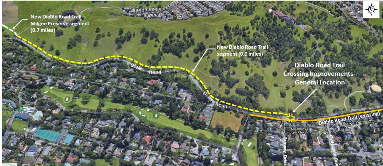
Exhibit 1 - General location of Diablo Road Trail Crossing Improvements